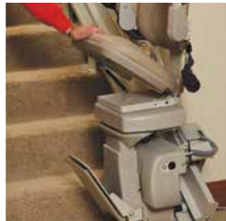
Power folding footrest automatically flips up/down when seat is raised/lowered.