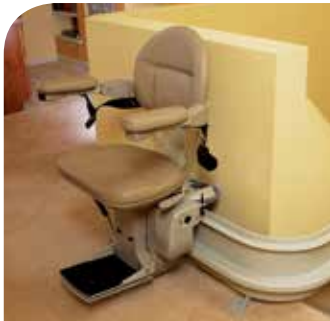
Top or bottom park position extends rail away from the staircase.