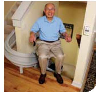
Mid-park and charge station for staircases with middle landings.