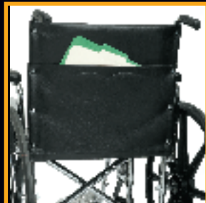
Chart pocket is included on 2000 and 2000HD models.

Dual axle allows seat to be easily lowered to hemi height. Available on 2000, 3000 and 4000 models.